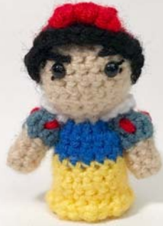
Two Hearts Crochet