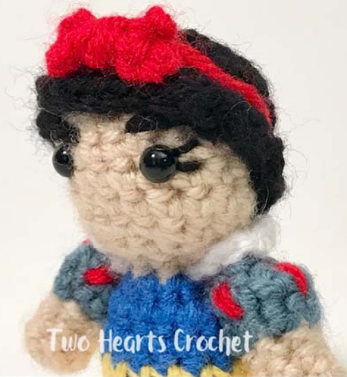
Two Hearts Crochet