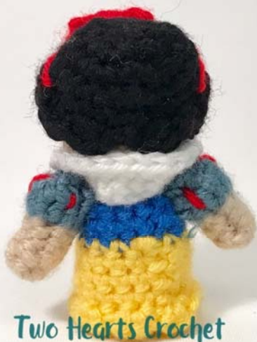
Two Hearts Crochet