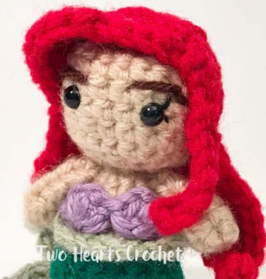
Two Hearts Crochet