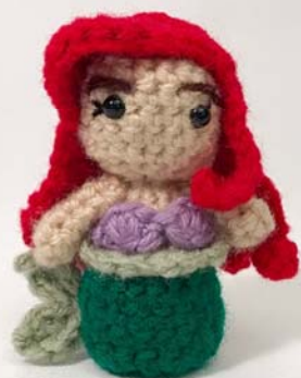
Two Hearts Crochet