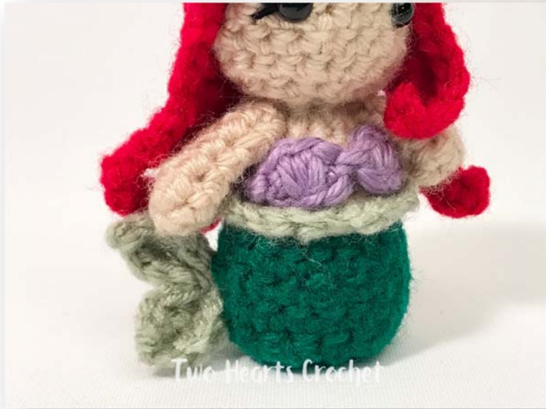
Two Hearts Crochet