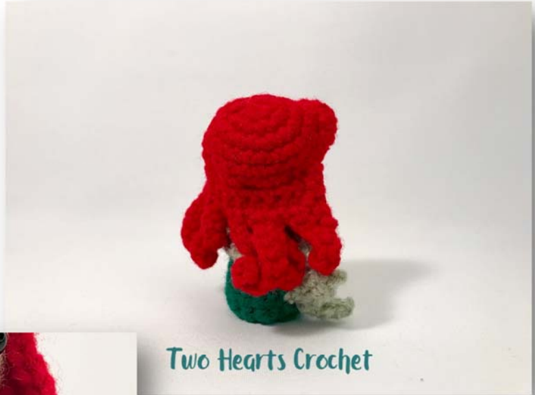
Two Hearts Crochet