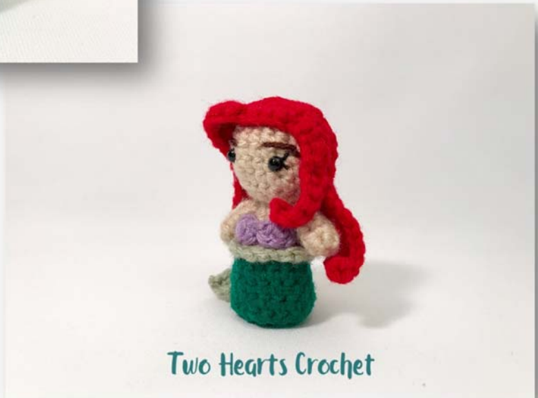
Two Hearts Crochet