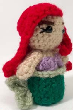
Two Hearts Crochet